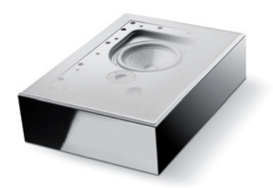
The optional On-Wall mounting frame broadens the IW 1002 mounting possibilities. The whole is 4" (10cm) deep with the integrated wall fixing.

With its sealed volume and its advanced technology including the Al/Mg dome tweeter of the Electra 1000 S line, the IW 1002 offers high-level sound performance in hifi as in multichannel systems, such as a 2-way traditional high-end loudspeaker would do. A very high-fidelity sound in an In-Wall version.